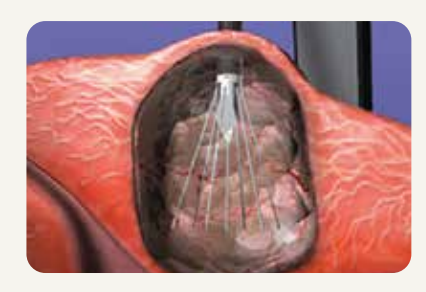
Fibroid Ablation and Handpiece Withdrawal